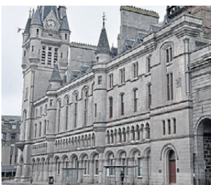
Aberdeen Sheriff Court.

Witness tells trial former advocate paid him '£5 or £10' after abuse